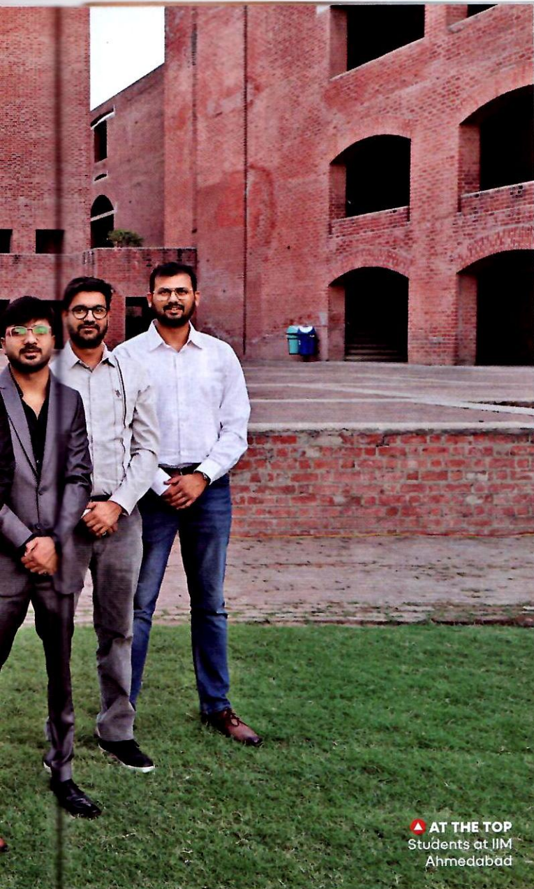
▲ AT THE TOP Students at IIM Ahmedabad